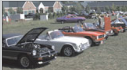
BAKER'S CAR SHOW: The last leg of the French Laundry Run ended here. Page 6