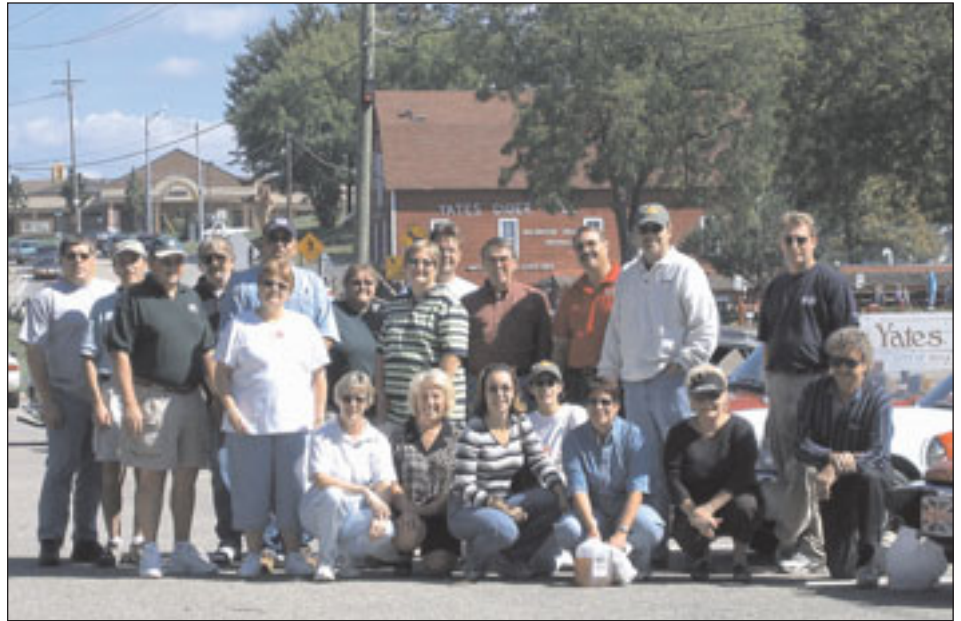
We took time out to take this group shot just before leaving Yates Cider Mill in Rochester.