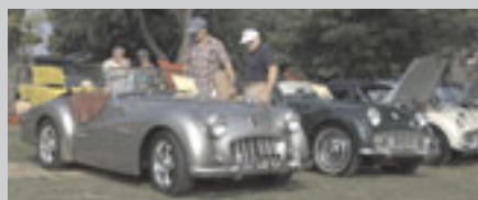
BATTLE OF THE BRITS RESULTS: Complete listings of balloting and judging. Page 4