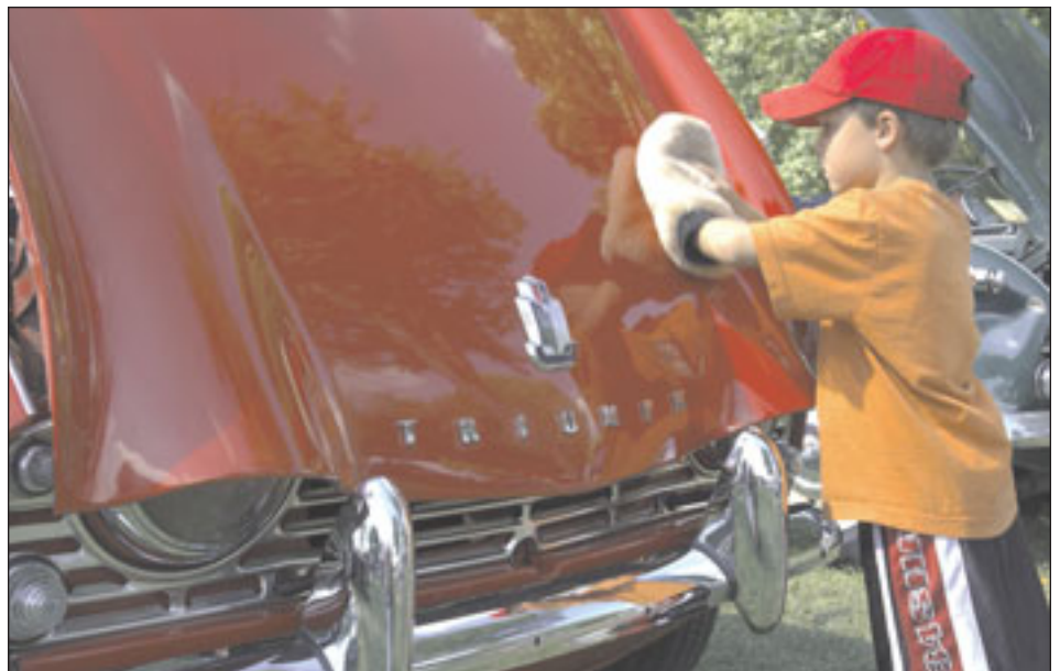
This young man helps to make his dad's Triumph TR4 shine at the Battle of the Brits show.