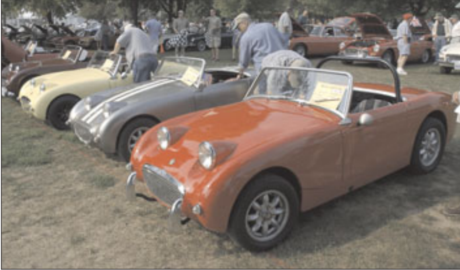
Each of the Bugeye Sprites were fine examples of the model. In spite of weather reports calling for rain throughout the day, turnout was the second-highest ever.