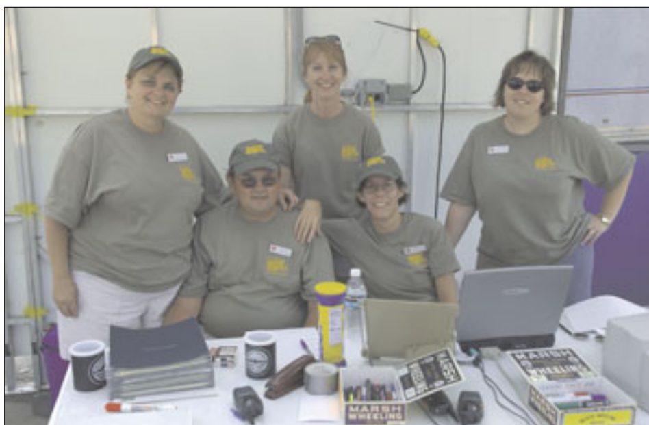
Several of the volunteers posed for a photo once things settled down in the registration area.